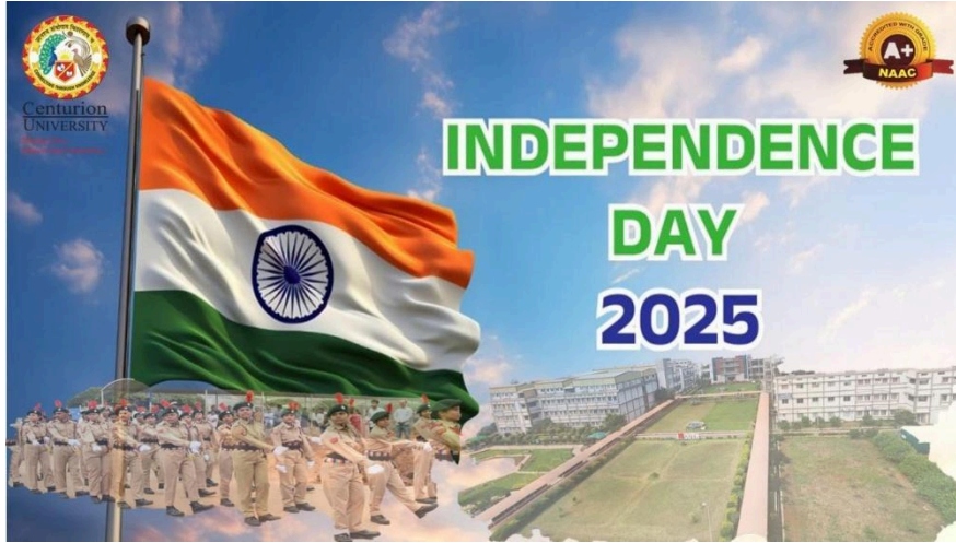
Banner for the event: 79th Independence Day Celebration – CUTM Paralakhemundi

Venue: Flag Hoisting Point & Auditorium, Centurion University of Technology and Management, Paralakhemundi Campus